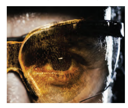
HydroShield anti-fog coating is permanently bonded to the lens, featuring dual-action properties that keep lenses clear up to 60X longer than our next best coating.